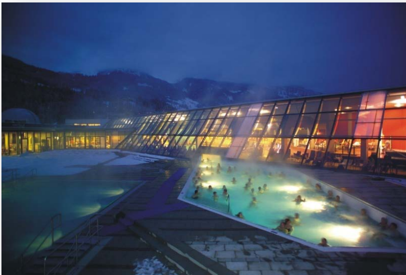
Alpen Therme Gastein